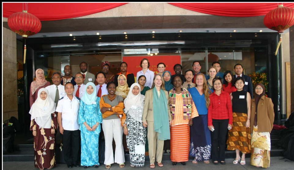
CAS National Partner Initiative Kuala Lumpur, Malaysia February 2008